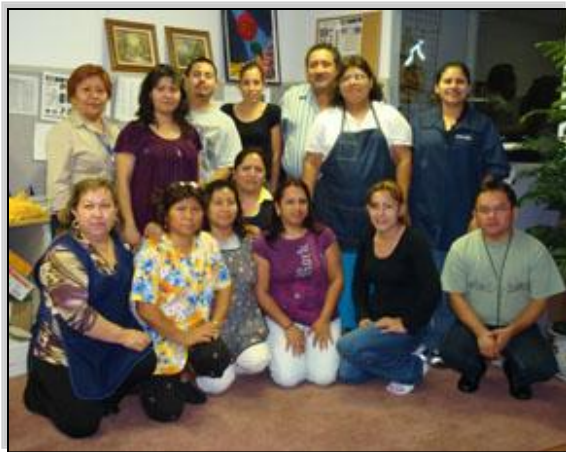
A team of our valued SOTech Employees – Main Plant , Night Shift, Team A

SOTech is a people-based operation. We are proud of the hard work our production operators have contributed to the American War Effort and to our company's success.