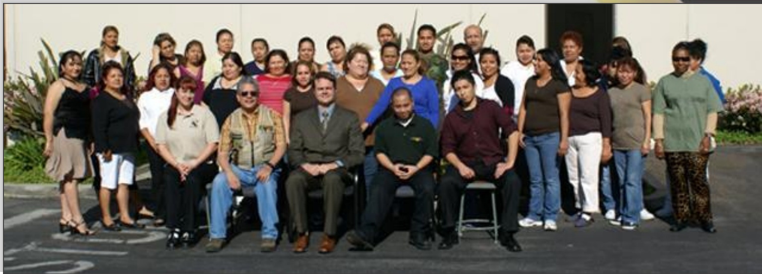
Plant A, Mass Production Team