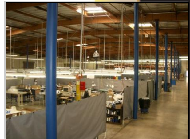
SOTech Plant B, also in the Los Angeles Region