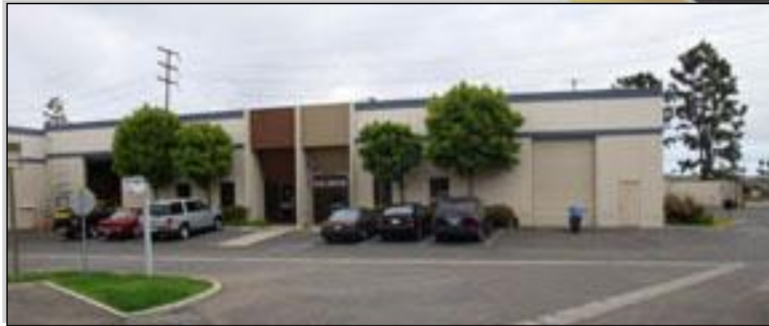
SOTech Headquarters and Plant A

Take a virtual tour of SOTech's facilities at www.SpecOpsTech.com